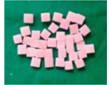
Fig.1 Acrylic resin specimens