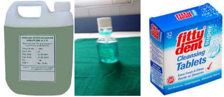
Fig.2 Disinfectant solutions

The following disinfectants were included in study are 1% sodium hypochloride, 0.2% w/v chlorhexidine gluconate and 3.8% sodium perborate (fig.2). The specimens were distributed into ten groups for each disinfectant <sup>1,2</sup>. The control group of six samples in which three are positive control and three are negative control i.e, positive control are contaminated whereas negative control are not contaminated and are sterile <sup>1,2</sup>.