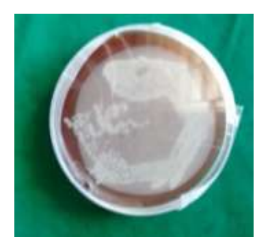
Fig.8 Candida before disinfection

Fig.7 Microbial suspension after disinfection