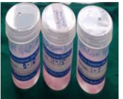
Fig.6 Samples in normal saline

biological oxygen demand incubator at 25^{\circ} C for 48 hours. After incubation , the grown fungal colonies of Candida albicans on SDA were counted before and after disinfection <sup>1,2</sup>.(fig.8,9)