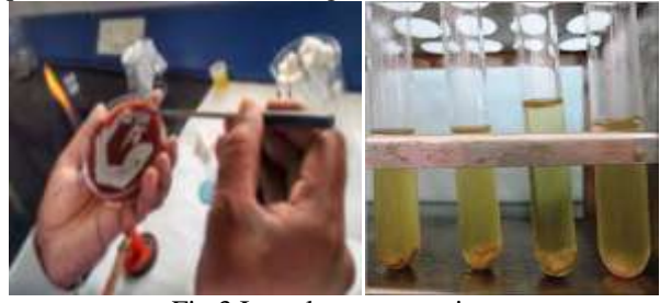
Fig.3 Inoculum preparation

1.5 \times 10^8 cfu/ml by transferring 1-2 colonies of 48 hours culture to BHI broth and incubated them at 35°C until the turbidity of media was equal to 0.5 McFarland <sup>2,6</sup>.(fig.3)