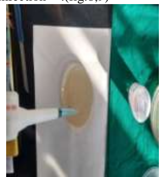
Fig.7 Microbial suspension after disinfection